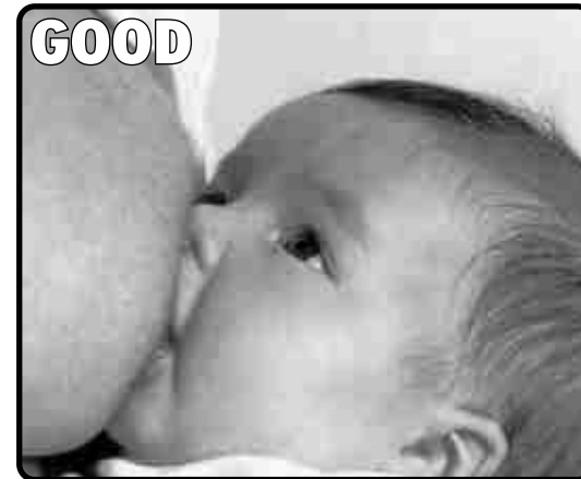
Image from the brochure of Breastfeeding from the Health Council of Andalusia.

The baby places his mouth around the nipple and most of the areola.